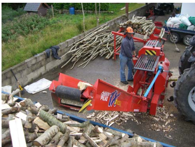
New firewood processor in operation