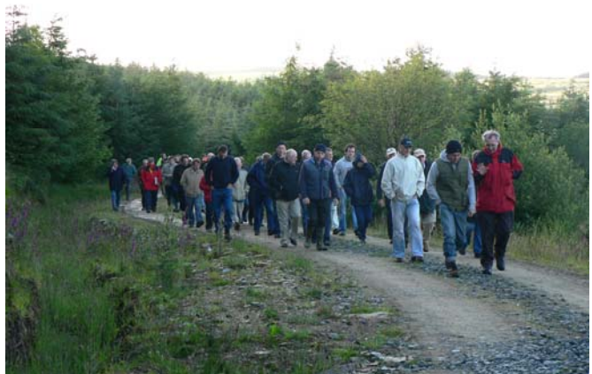
Group pictured at the very successful Forest Road Event 25th June 2008