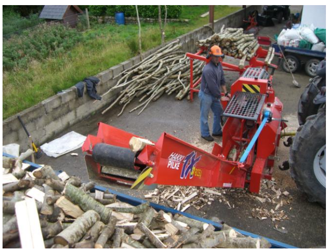
New firewood processor in operation