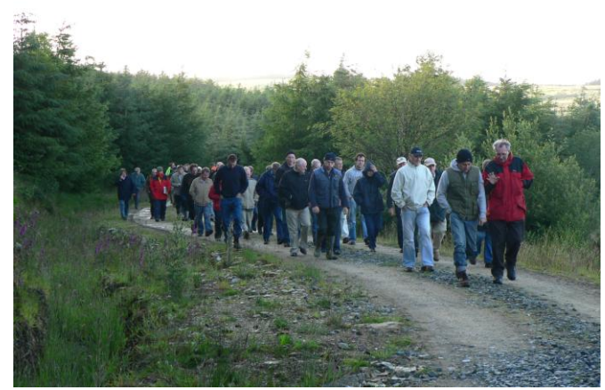
Group pictured at the very successful Forest Road Event 25th June 2008